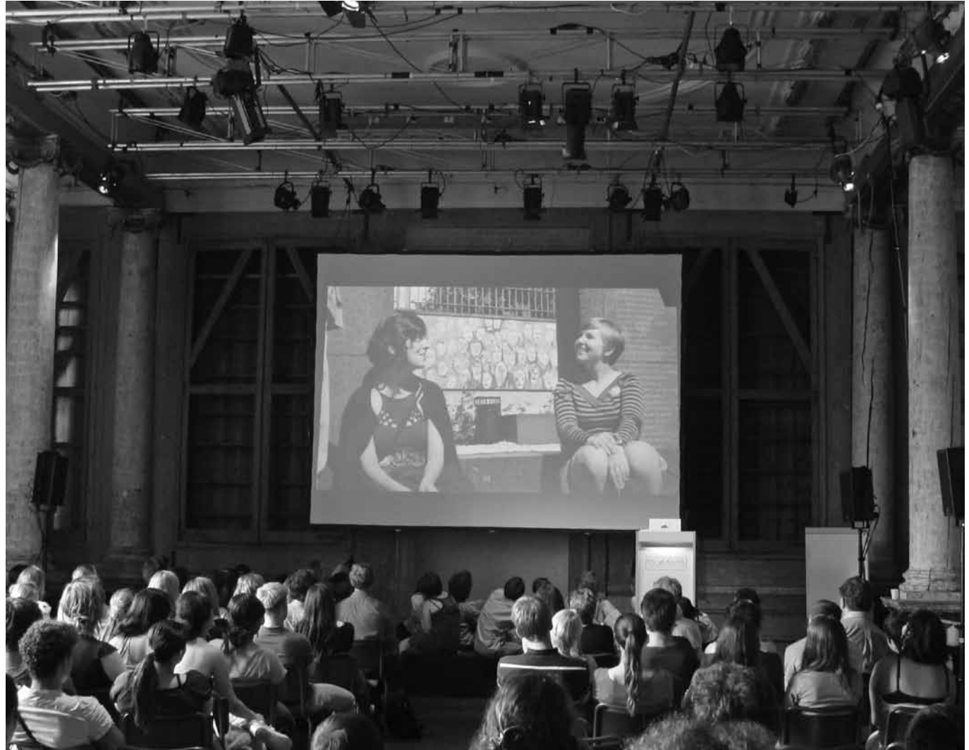
2010 Fellows at the First Annual Humanity in Action International Conference in Amsterdam.