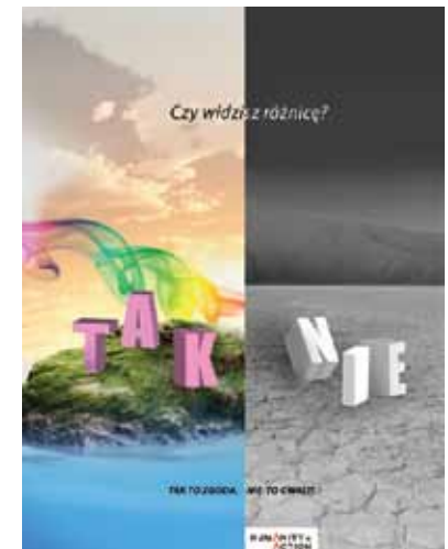
Poster designed by 2011 Polish Fellows for an Anti-Rape Campaign.